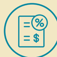
Tax Update regression test automation