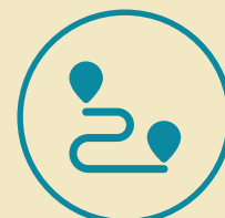
End-to-end process test automation