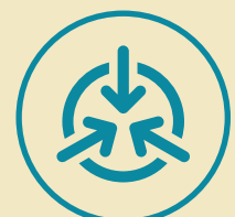
Integration Test Automation