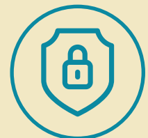
Security and Compliance test automation